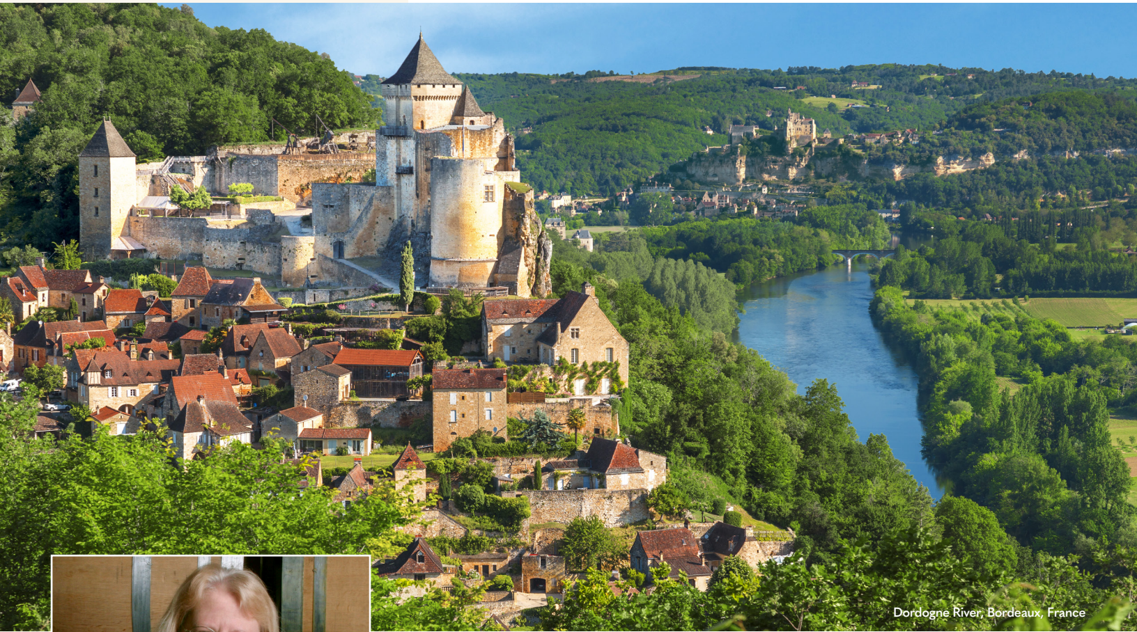
Dordogne River, Bordeaux, France